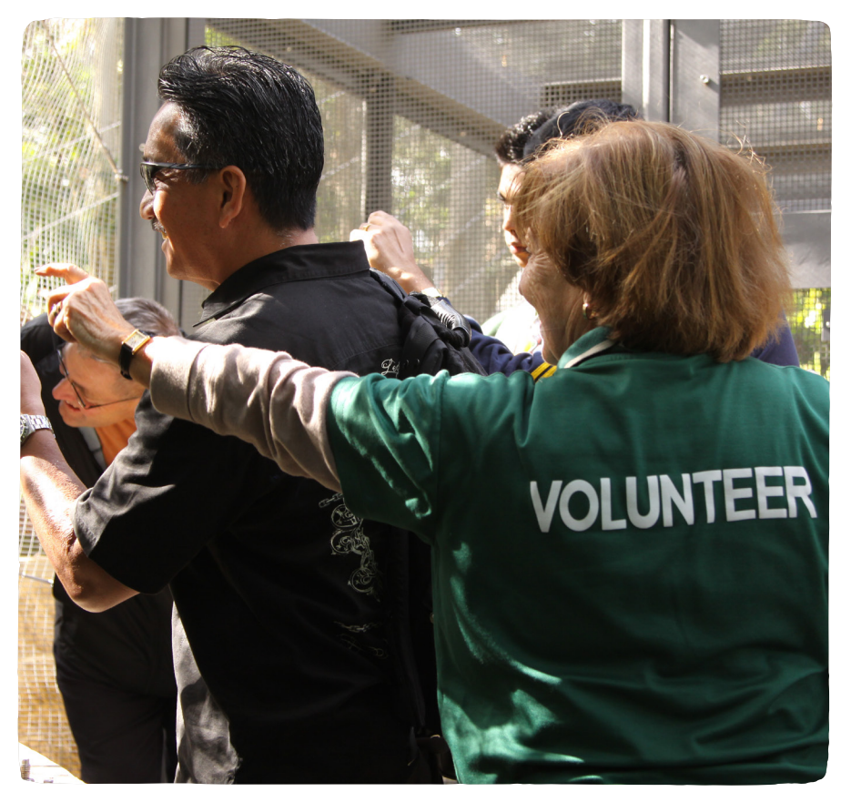
Committed volunteers lending a helpful hand throughout various sections of the Zoo

In addition to the Code, you must comply with any relevant legislative, industrial and administrative requirements and any lawful direction made by a person with the authority to give such a direction.