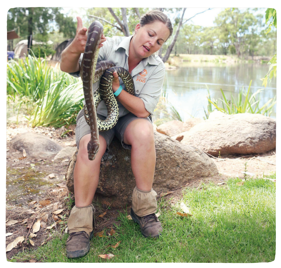
Education Centre Taronga Western Plains Zoo

All employees should be careful in their dealings with former employees of Taronga and make sure that they do not give them, or appear to give them, favourable treatment or access to privileged or confidential information.