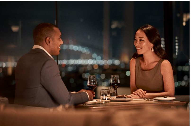
Images: Animal View Room (left) and Me-Gal restaurant with panoramic Harbour views (right).