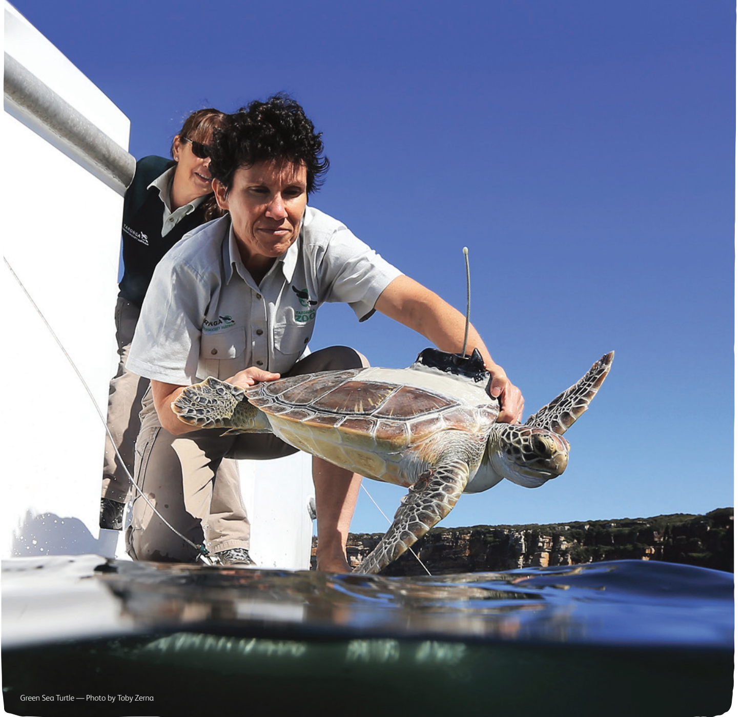
Green Sea Turtle

Taronga Conservation Society Australia September 2023