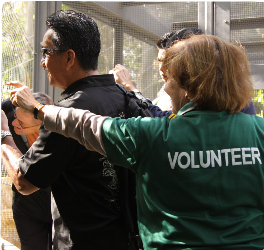
Committed volunteers lending a helpful hand throughout various sections of the Zoo

In addition to the Code, you must comply with any relevant legislative, industrial and administrative requirements and any lawful direction made by a person with the authority to give such a direction.