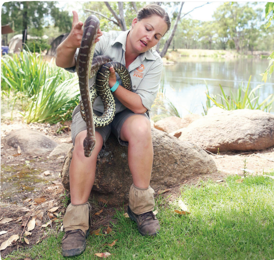
Education Centre Taronga Western Plains Zoo

All employees should be careful in their dealings with former employees of Taronga and make sure that they do not give them, or appear to give them, favourable treatment or access to privileged or confidential information.