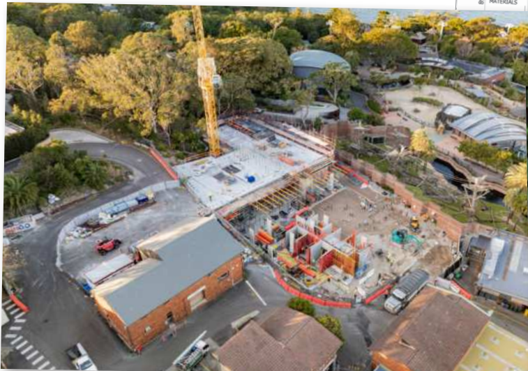
Work is underway, thanks to your support!