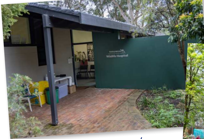
While construction is underway at the new site, the old Hospital still remains in operation to care for its patients.