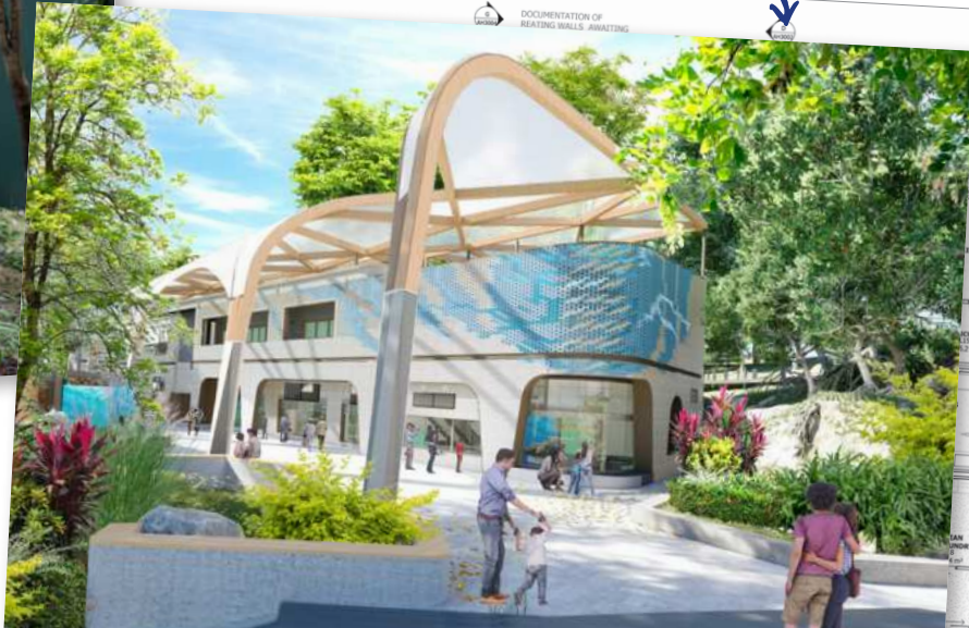
The vision for a new Hospital. From this to this