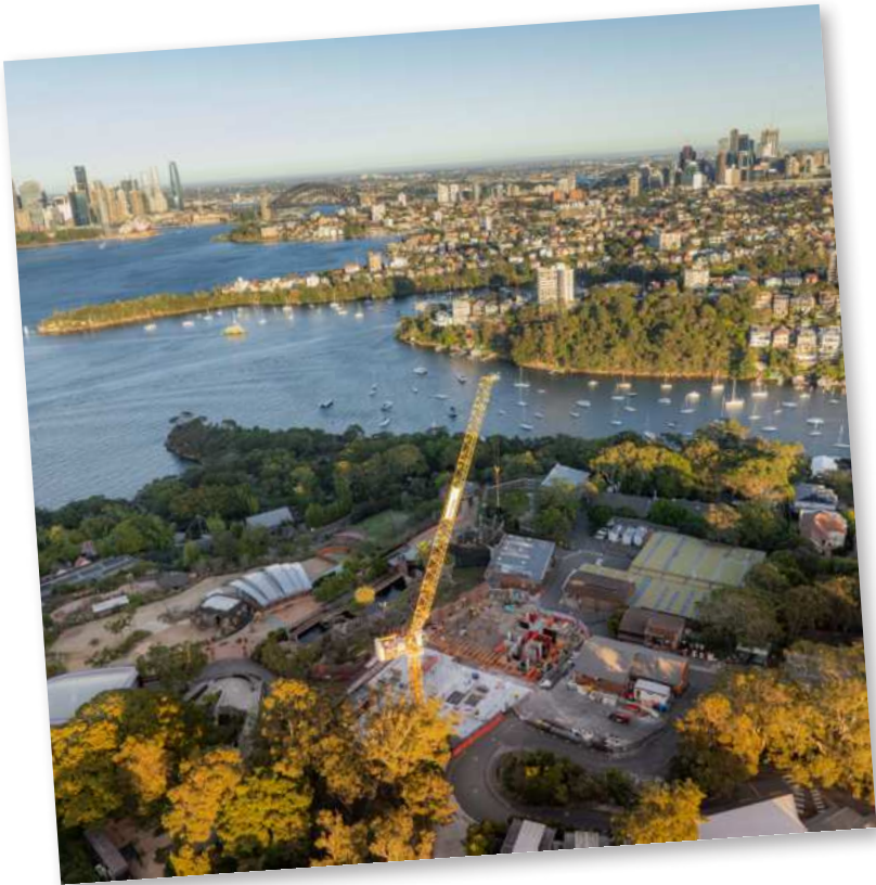
A birds-eye view of the site of the new Hospital.

Taronga's new state-of-the-art Wildlife Hospital represents the future of saving and protecting Australia's most precious native species. A modern hospital that provides critical care for even more sick and injured animals. We know severe weather events such as floods, bushfires and droughts are a part of our future. These incidents result in loss of habitats for species such as Platypus, Koalas, as well as our beautiful Marine Turtles and other marine animals.