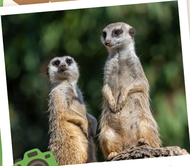
Scientific Name: Suricata suricatta Common Name: Meerkat