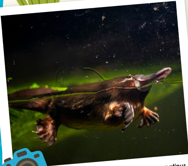
Scientific Name: Ornithorhynchus anatinus Common Name: Platypus

The Platypus is a special Australian animal that lives in rivers and creeks. It is the animal emblem of NSW and Taronga Conservation Society Australia.