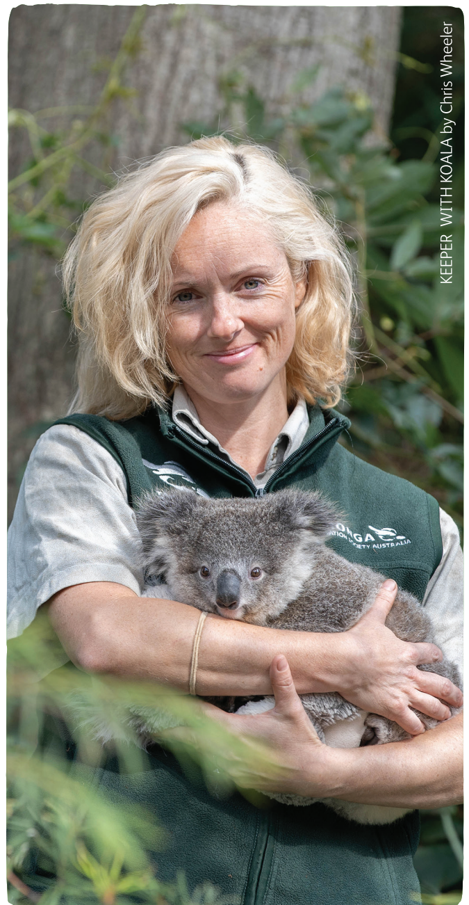
KEEPER WITH KOALA by Chris Wheeler

Finally the website also details conservation, education and research programs the Zoo is currently involved with.