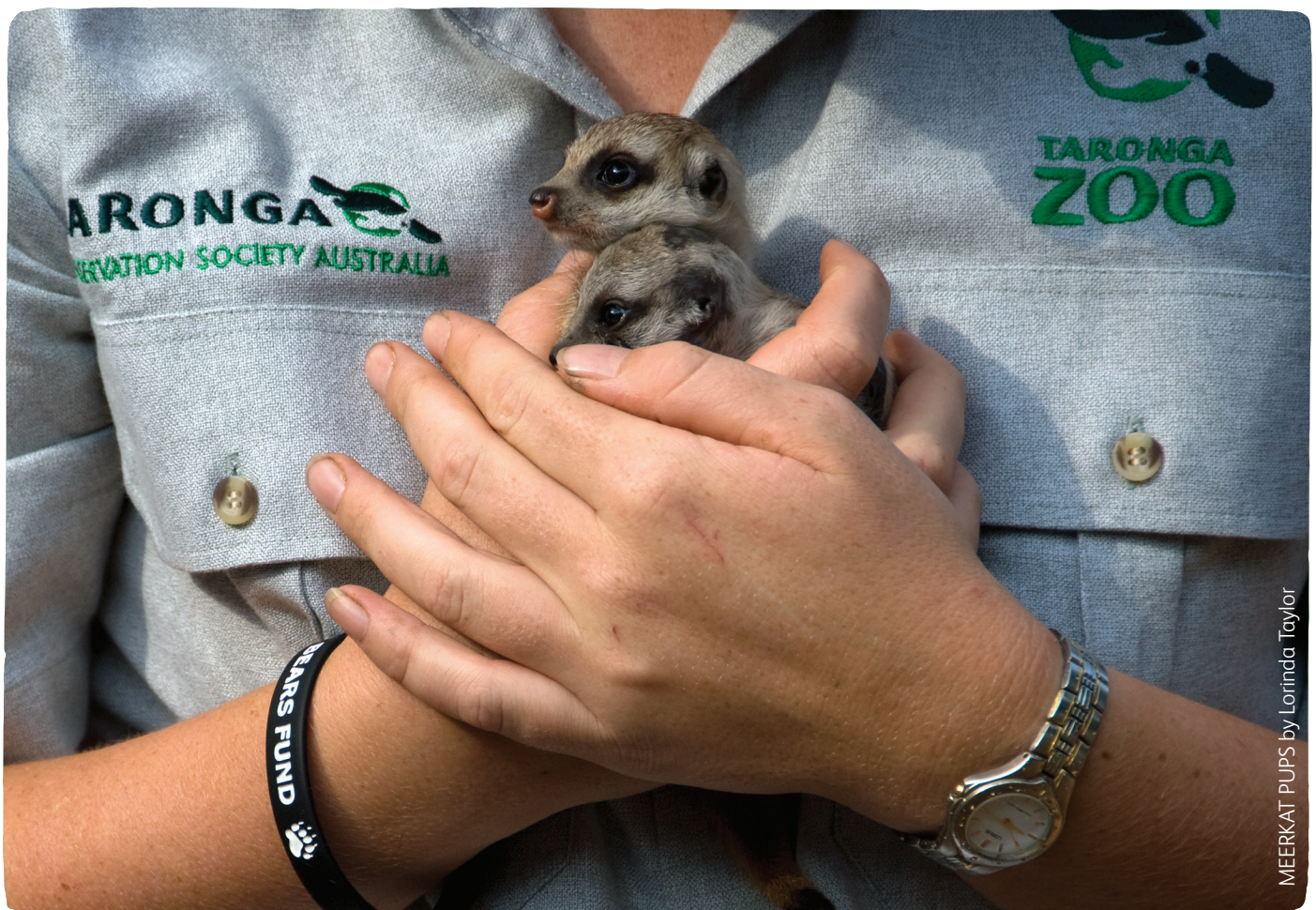
MEERKAT PUPS by Lorinda Taylor

http://educationstandards.nsw.edu.au/wps/portal/nesa/11-12/stage-6-learning-areas/hsie/business-studies