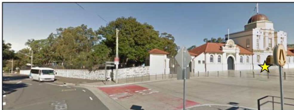
Street View – Front on. (Yellow Star denotes entrance)