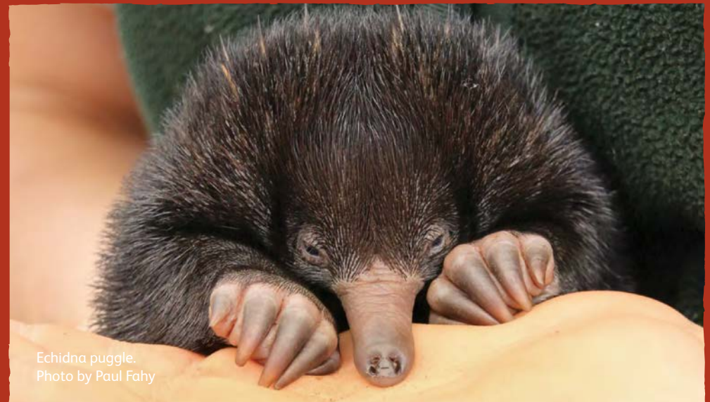
Echidna puggle.