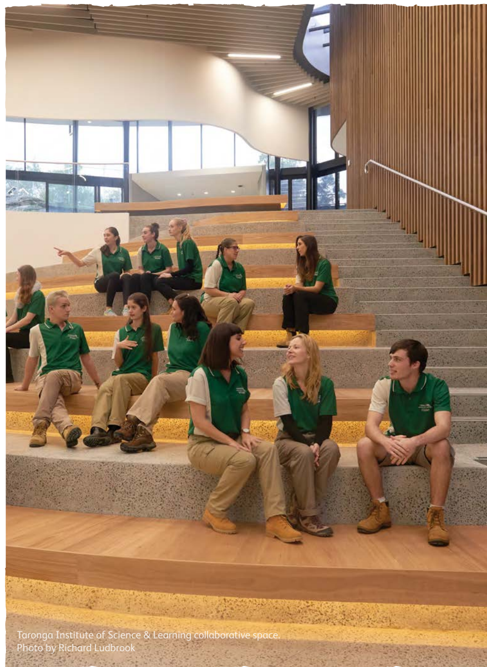
Taronga Institute of Science & Learning collaborative space.

Biodiversity is not a luxury – it is a necessity. Global trends indicate wildlife population numbers are decreasing dramatically due to natural and human influences. Taronga's Conservation Society is perfectly placed to engage students with depth studies. Students will engage with Taronga's scientists and experts to deepen their understanding of risks threatening populations and conservation efforts. Students will design initiatives that empower people to take action to reduce threats to wildlife and ecosystems. This excursion will contribute five hours to a depth study and is complimented by pre and post excursion activities.