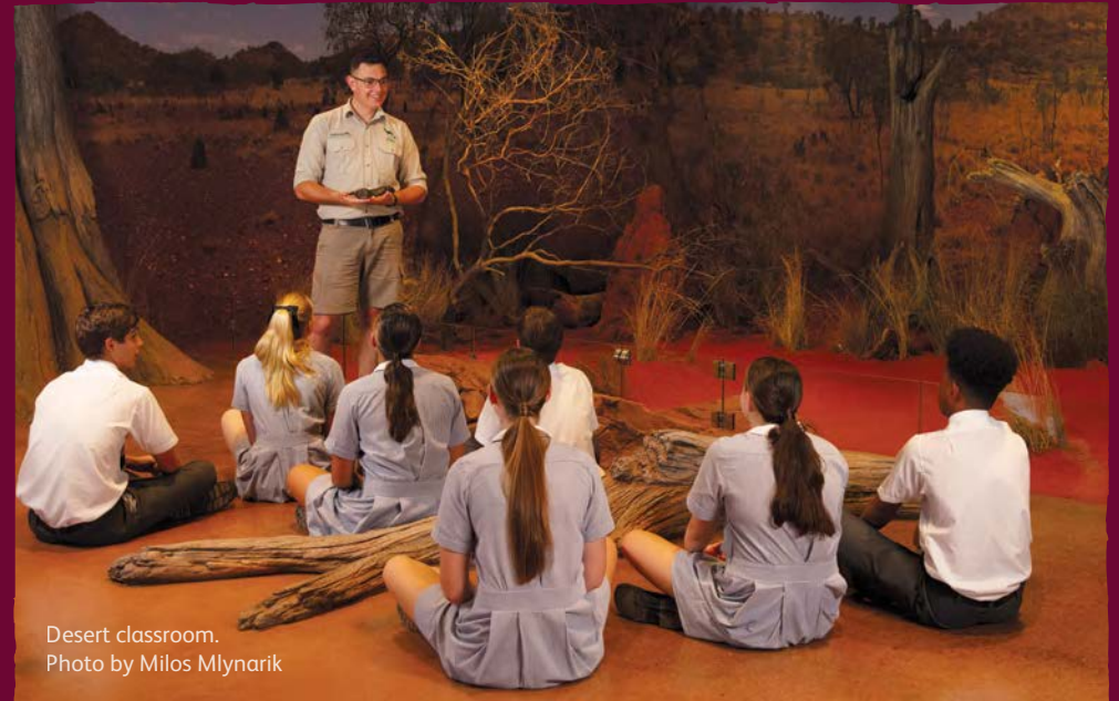
Desert classroom.

Through the new Taronga Institute and Habitat Classrooms, we all now have the opportunity to shape the mindset of the next generation of conservationists and inspire them to action.