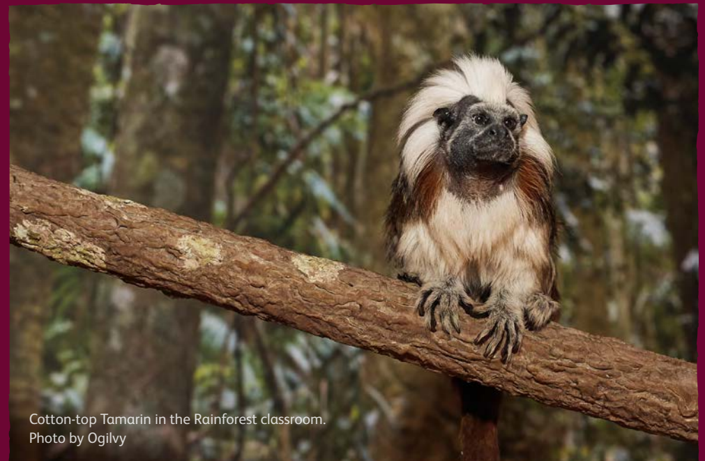
Cotton-top Tamarin in the Rainforest classroom.