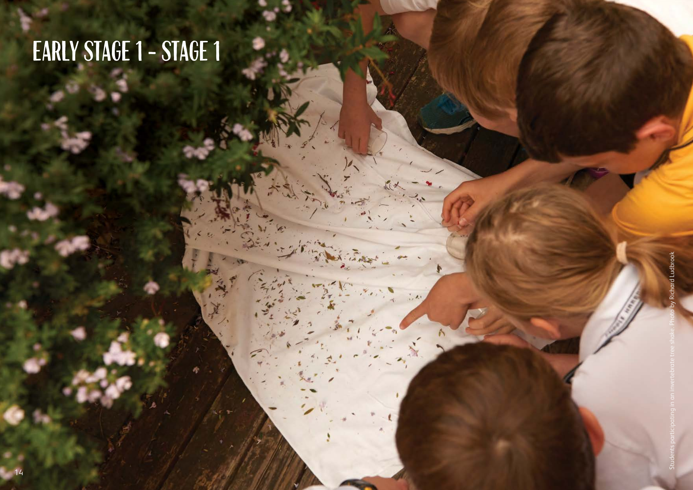
Students participating in an invertebrate tree shake.