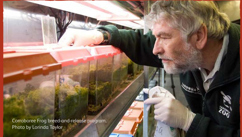
Corroboree Frog breed-and-release program.

Visit www.sydney.edu.au/courses/master-education-taronga-conservation Call 1800 793 864