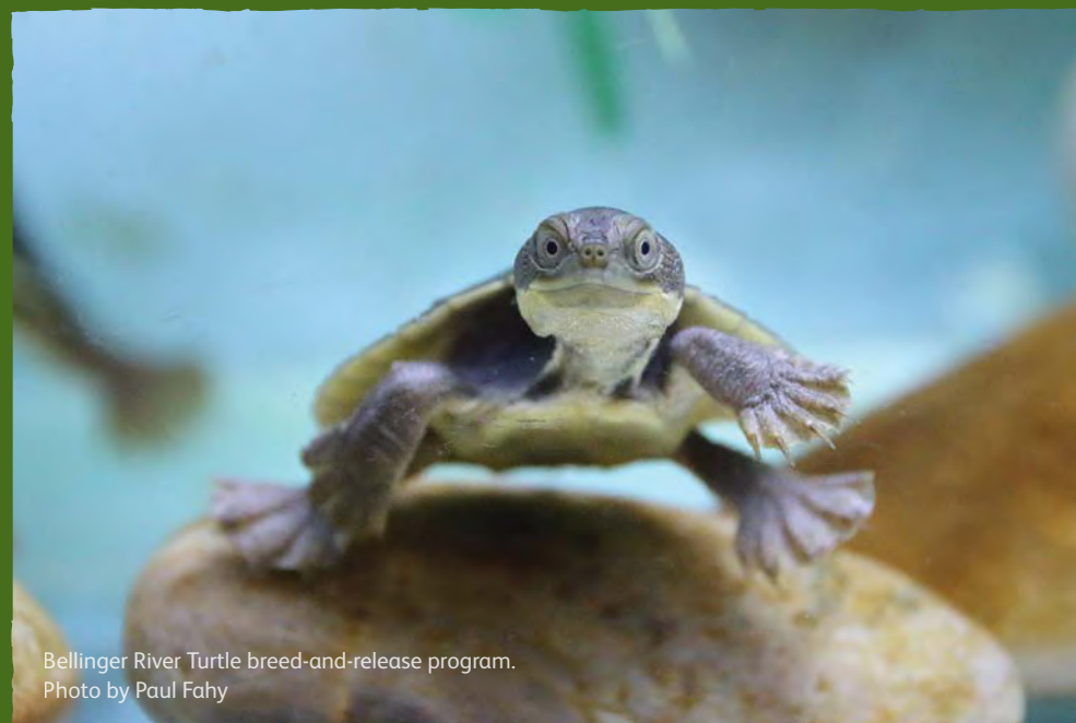
Bellinger River Turtle breed-and-release program.