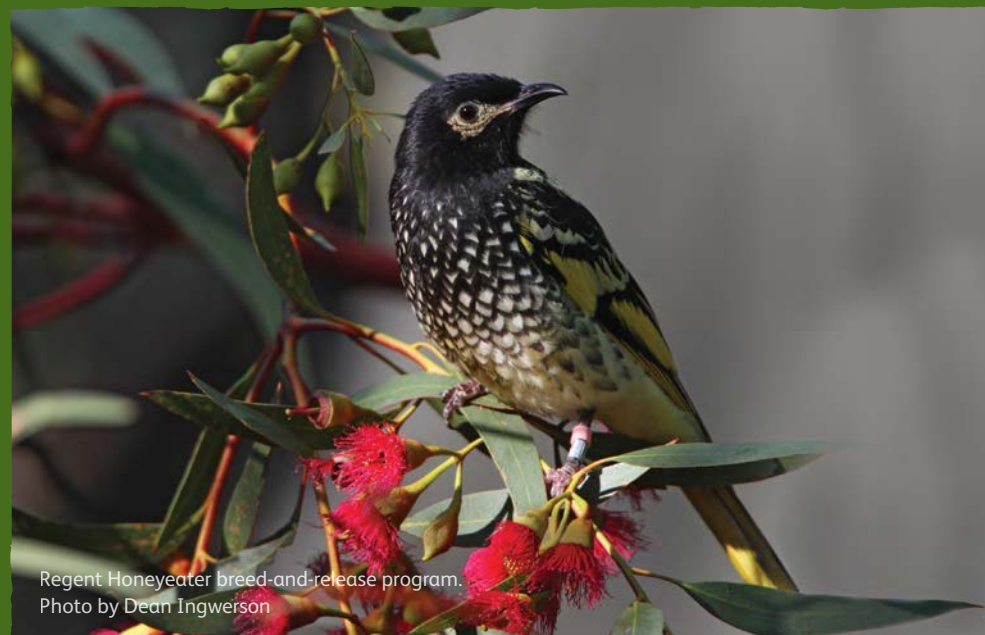
Regent Honeyeater breed-and-release program.

Behavioural observations allow scientists to collect and record data enabling them to test hypotheses to ensure animal wellbeing and survival. Taronga Zoo is the perfect environment to plan, observe and record animal behaviour. In this workshop students will collect primary data through authentic scientific animal observations.