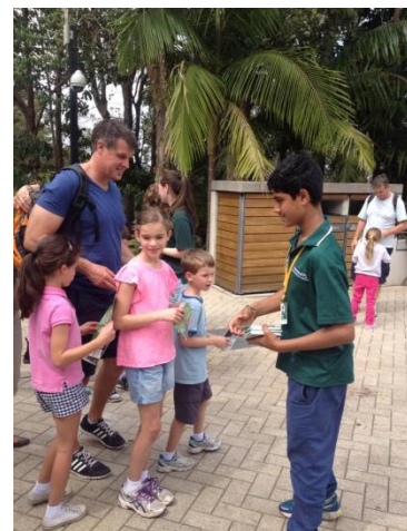
Handing out maps