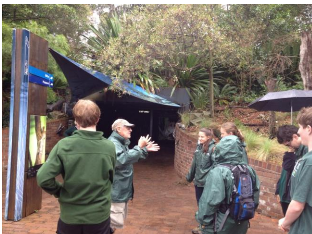
Guest Experience Operations Training

Volunteering in this area teaches YATZ vital skills for interacting with the public.