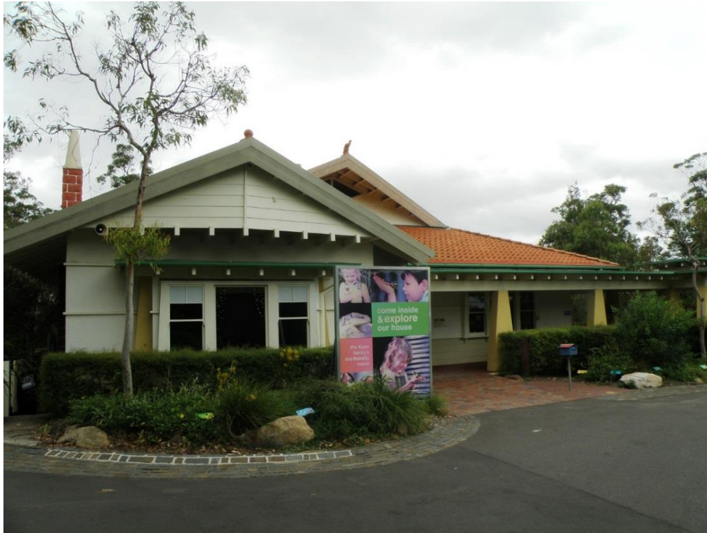
Farm (map ref. C3)